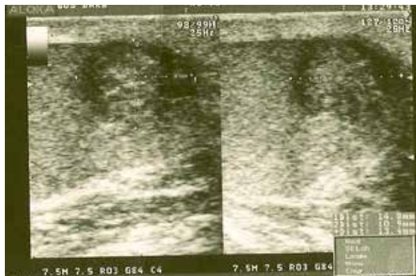
Fig. 1. A heterogeneous heteroechoic formation of 14×10.9×13.4 mm in the upper pole of the right testicle with a clear, even contour.

days in the consultative polyclinic of Saransk Children's Republican Clinical Hospital, the formation was detected, a second ultrasound of the scrotum was performed, in which no dynamics was observed (Fig. 1). Ultrasound examination demonstrated a chronic non-calculous cholecystitis.