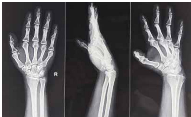
Fig. 3. Radiographs of the right upper limb without any pathology

“pop”. The distal stump of this tendon was retrieved through an incision above MCP. Its edge was uneven, shabby and degenerative (Fig. 4 A).