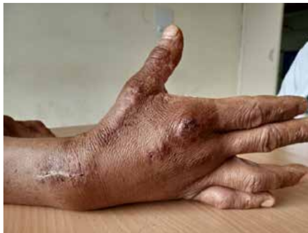
Fig. 6. Photo of patient's hand after 3 months of surgery.

Spontaneous rupture of EPL tendon should be considered in patients with a sudden loss of extensor movement in the interphalangeal joint of the thumb, even in the absence of any predisposing factor. The presence of a hypoechoic thickened zone in the area of disruption of collagen fibers indicates that the cause of the gap was not only a thinning, but also a degenerative process. In our opinion, ultrasound examination plays an important role in the process of confirmation of tendinitis and tendinosis.