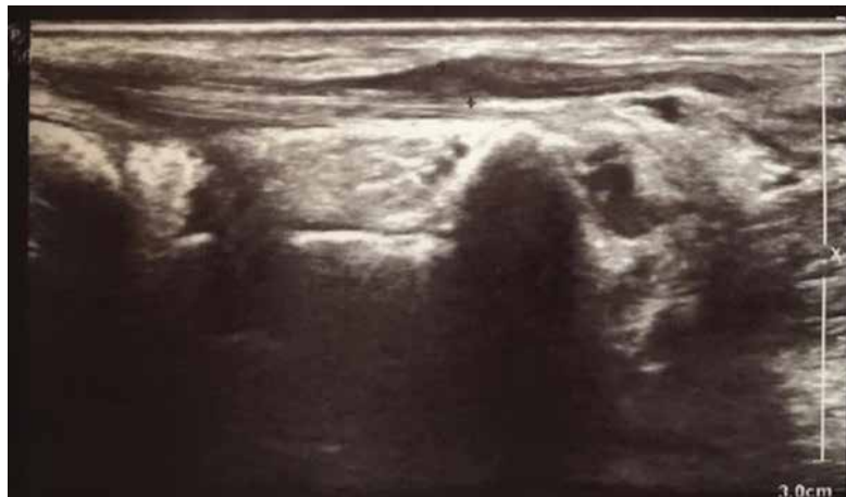
Fig. 2. Ultrasonographic view of EPL: hypoechoic area measuring about 3 mm at the site of tendon rupture.