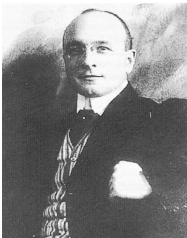
Fig. 3 a. Alexis Carrel