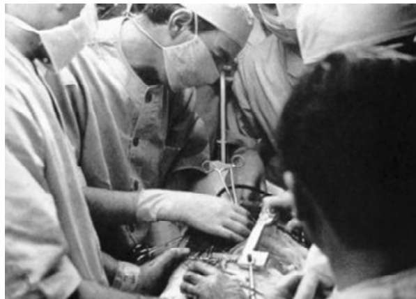
Fig. 6. Christian Barnard during his first heart transplantation