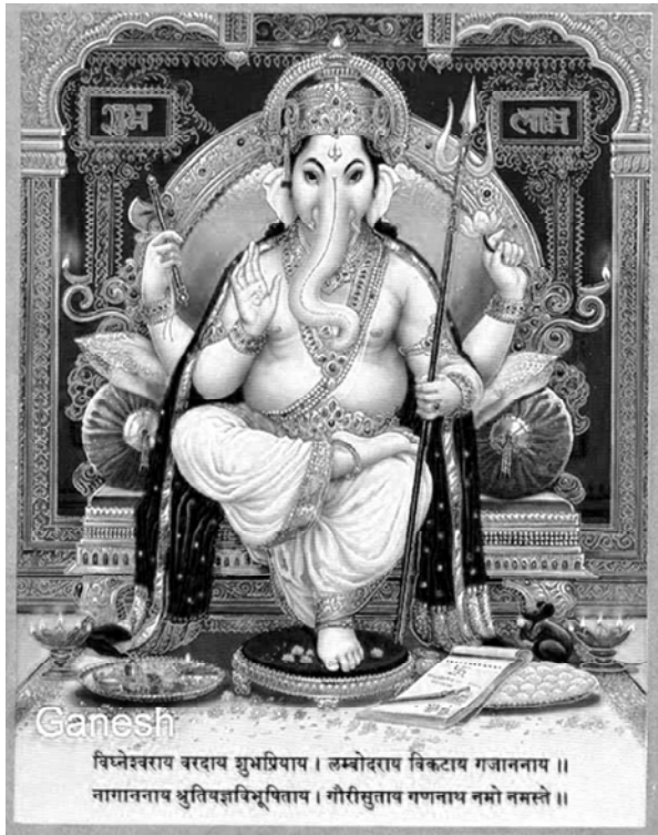
Fig. 1. Ganesha, 12th century B.C.