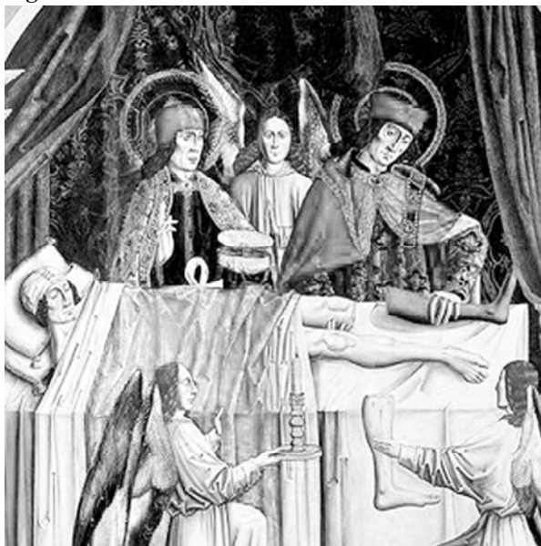
Fig. 2. St. Cosmas und Damian

Cosmas and St. Damian, Syrian healer and patrons of the doctors and barbers (martyrs after their execution on September 27 th in 287), replaced the leg of a Christian during his sleep using the leg of a dark skinned Ethiopian who died the day before (fig. 2), [2].