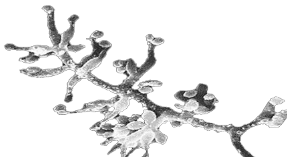
Fig. 4. Fungi imperfecti (Cyclosporin)

technique developed in Paris, in which the donor kidney (twin brother of the patient) was placed in the fossa iliaca and the ureter in the bladder of a